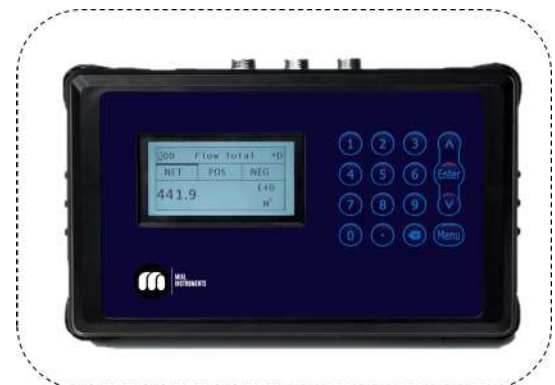
MUF 1000 Portable Clamp On Ultrasonic Flow Meter

The MUF 1000 can assist in the service and maintenance of flow systems by providing accurate flow data, conducting audits, evaluating system capacity, and monitoring the performance of pumps and regulating valves.