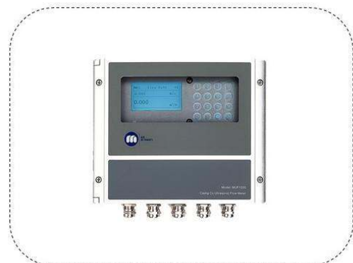
MUF 1200 (0.5%) Clamp On Ultrasonic Flow/BTU Meter

For assessing the performance and efficiency of fluid systems, the MUF 1200/MUF(B) 1200 Clamp on Transit Time Ultrasonic Flow/Btu Meter delivers unmatched accuracy. Whether it's evaluating the effectiveness of pumps or monitoring regulating valves, this meter provides comprehensive insights. Its ability to measure both flow and thermal energy facilitates thorough performance assessments, enabling proactive maintenance and optimization strategies.